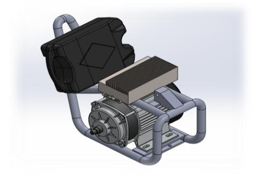
Figure 2. Mounting chassis withMotor, Battery & Controller