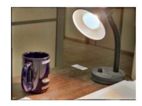
Figure 3: CNN output picture.