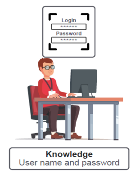
Figure: Knowledge level Authentication

In this level something is the user knows, such as a password, simply, a "secret" for the authentication