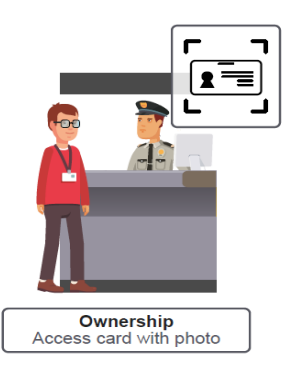
Figure: Ownership level Authentication

In the Ownership level that something the user has, such as cards, smartphones, or other tokens