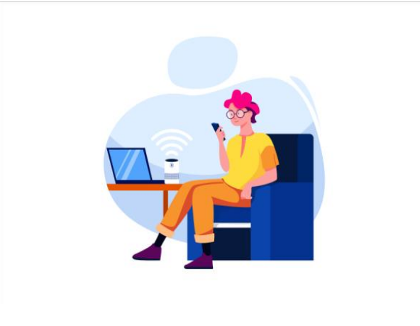
Fig. Voice Assistant

Speech recognition technology has grownup leaps and bounds within the twenty 1st century and has nearly get through to roost. Look around you. There may even be variety of devices at your disposal at this extremely moment. Let's check an courant style of the leading choices.