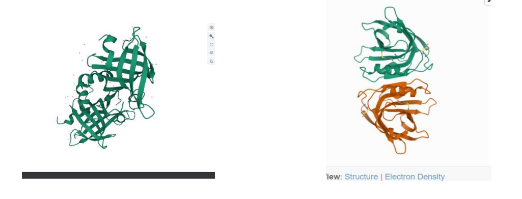
Figure 1: 2DStructure of Glycodelin Protein Figure 2: 3DStructure of Glycodelin Protein

The Glycodelin Protein was retrieved in pdb format from Protein Data Bank at 2.45 Å resolution in 2D and 3D respectively in [figure 1&2].