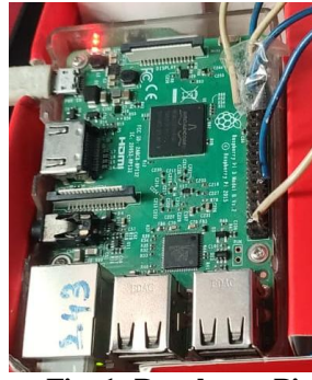
Fig. 1- Raspberry Pi

The Raspberry Pi 3 Model B is the third generation Raspberry Pi. This powerful credit-card sized single board computer can be used for many applications and supersedes the original Raspberry Pi Model B+. Whilst maintaining the popular board format the Raspberry Pi 3 Model B brings you a more powerful processor, 10x faster than the first generation Raspberry Pi. Additionally it adds wireless LAN & Bluetooth connectivity making it the ideal solution for powerful connected designs.