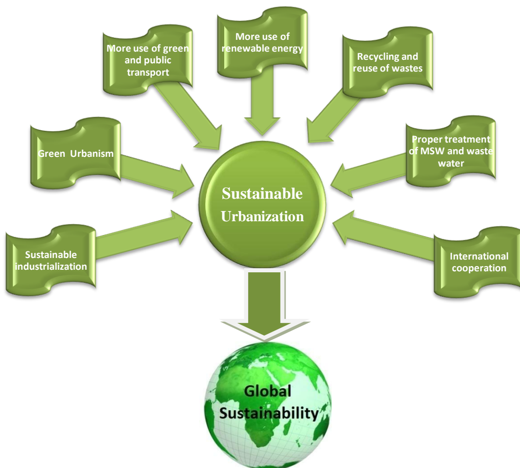
Fig-III: Potential strategies for global environmental sustainability