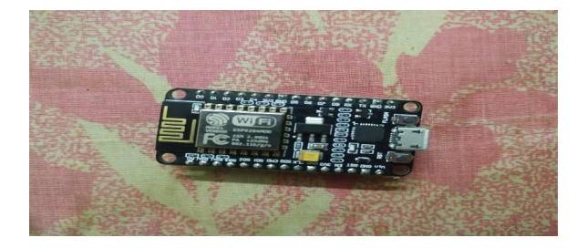
Fig. 1 - ESP8266 NODE MCU WIFI SOC

NODE MCU is a open source prototyping board design. It is acts as a connecting device between software and hardware. These are low-cost breadboardfriendly modules which are aimed at providing a simple to configure and set up, hardware platform for developing ESP8266-based Lua IoT applications.