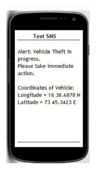
Fig 3 Alert message

The kit consists of an ARDUINO board, GSM, GPS. This GSM based vehicle theft control system retrieves vehicle status is whether it is in theft mode. This data is fed to the ARDUINO, which is interfaced to a GSM modem. Whenever the vehicle is in theft hands automatically the owner get the message and the owner stop the vehicle through mobile phone.