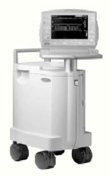
Figure 1.Console for intra aortic ballooncounterpulsation

The drive console consists of a pressurized gas reservoir, a monitor for ECG and pressure wave re-cording, adjustments for inflation/deflation timing and triggering selection switches. It is portable, light weight and has the option of mains and battery operation. There are two types of consoles, Stationary and Portable. Stationary consoles are used at the bedside and for short distance transport. Portable consoles are used for long distance transfer. The gases used for inflation are either helium or carbon dioxide. Helium has low density and rapid diffusion coefficient. However carbon dioxide has an increased solubility in blood, which reduces the potential consequences of gas embolization following a balloon rupture <sup>[1]</sup>.