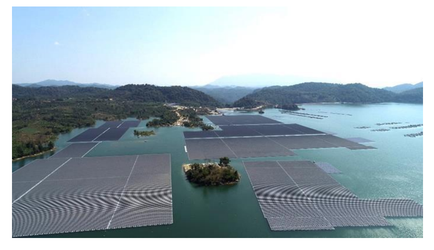
Figure 3-Solar Panels Installed on Da Mi Hydroelectric Reservoir

VND (EVN, 2019). The solar project in Vietnam is currently limited to land-based projects. Due to the land usage issue and for better utilization of land for agriculture purpose, the Vietnam government is considering adapting floating PV projects to maximize the benefits that it get from Solar energy (Vietnam Business, 2019).