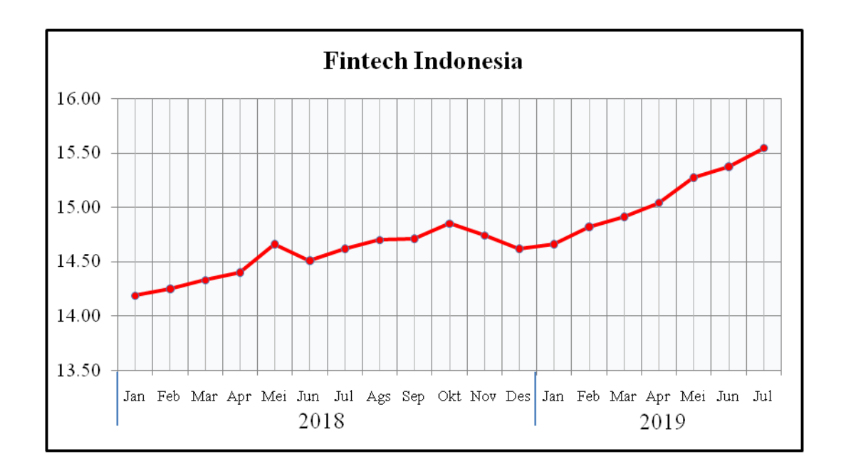
Figure 2. Fintech of Indonesia

The phenomenon of society shows that the use of financial technology (financial technology) has increased during the Covid-19 pandemic, thus providing digital financial solutions that can encourage the economic recovery if Indonesia.