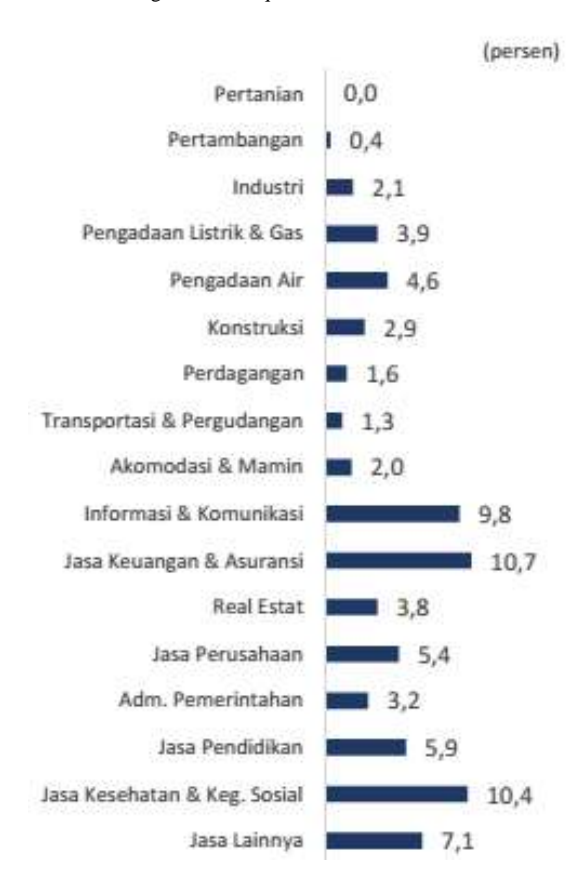
Figure 4. The Growth of GDP in the Production Side in the Quarter I of 2020 (Source: Central Bureau of Statistics, 2020)

The growth that occurred in the processing industry was 2.1 percent, slower than in the previous period mainly due to the slower growth of the non-oil and gas processing industry. The slow growth in the non-oil and gas industry was caused by contraction in imports of raw materials during the first quarter of 2020 accompanied by slow non-oil and gas exports. The majority of the non-oil and gas industry contracted. The food and beverage industry which has a fairly large role in the non-oil and gas industry also experienced slow growth from 6.8 percent in the first quarter of 2019 nebhadu 3.9 percent. Despite the slow growth, the chemical and transportation equipment industries are still growing positively. In the coal sector and oil and gas refineries, they experienced a positive growth of 2.6 percent after contracting in the first quarter of 2019, this is due to an increase in the production of fuel oil and LPG.