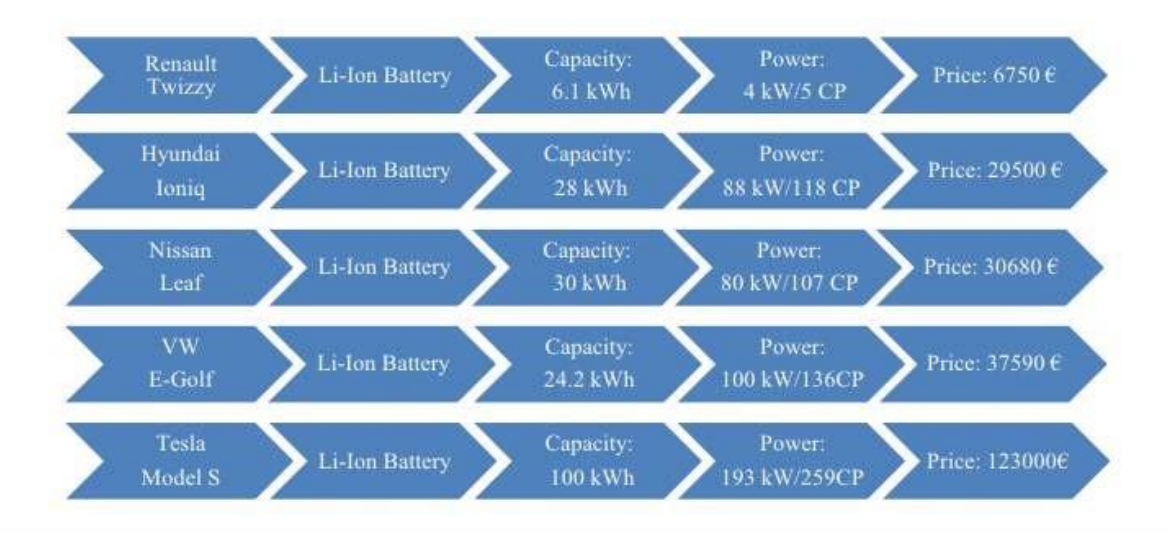
Fig 2. Comparative evaluation of different electric vehicle market cost.[4]

efficiency. Lithium-ion batteries are extremely likely to contribute more to the current markets and the lives of people as the development of new products, innovations and strategies continues to advance.[2]