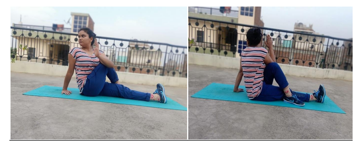
Fig. 2, 3 Ardha Matsyendrasana (side view)