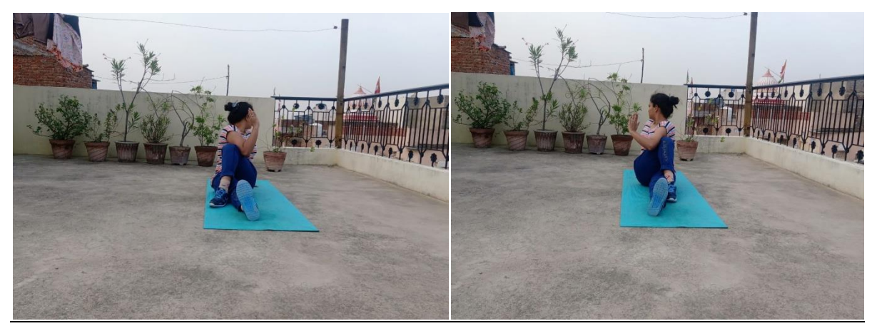
Fig..4, 5 Ardha Matsyendrasana (front view)