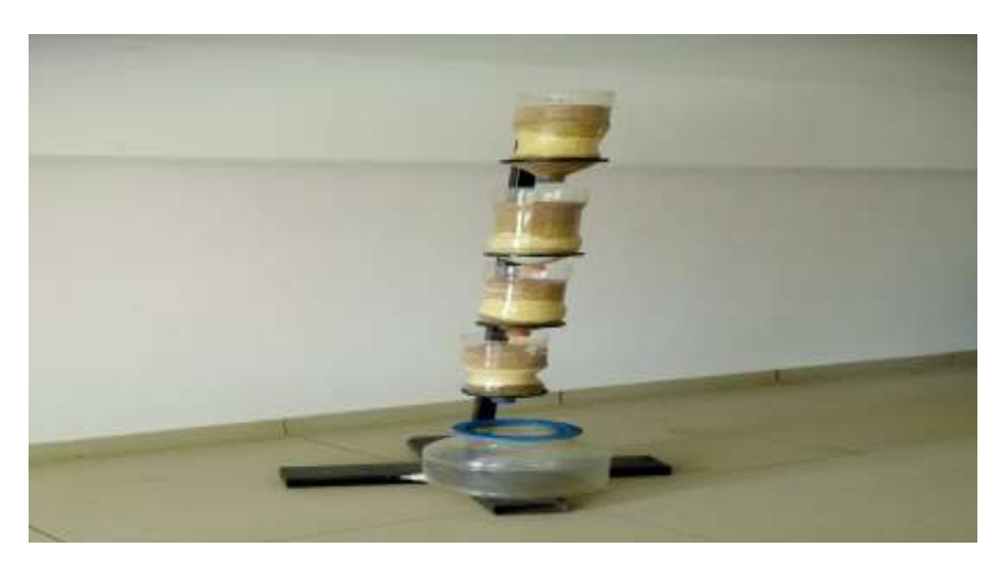
Figure 1: Experimental model

METHODOLOGY: The study was carried out in an experimental setup of filtration media in a vertical stand with 4 bottle compartments. Each bottle compartment consists of filtration materials depending upon larger to smaller voids (R.A. More & S.K. Dubey 2014). At top most layer laterite soil grains of about sieve size passing from 4.75mm and retaining in 1.18mm is filled in bottle compartment. In second most layer rice husk is placed for better adsorption of dairy wastewater. In next layer powdered orange peel and groundnut shell is placed as it is finer media it efficiently adsorbs the wastewater. Between each layer filter paper is provided likewise 4 compartments are prepared and fitted in vertical stand. In bottom water can is provided to collect the waste water passing from filtration media which is considered to be treated waste water from low cost adsorbents. Collected water is tested and replaced in preparation of concrete moulds using M20 mix design.